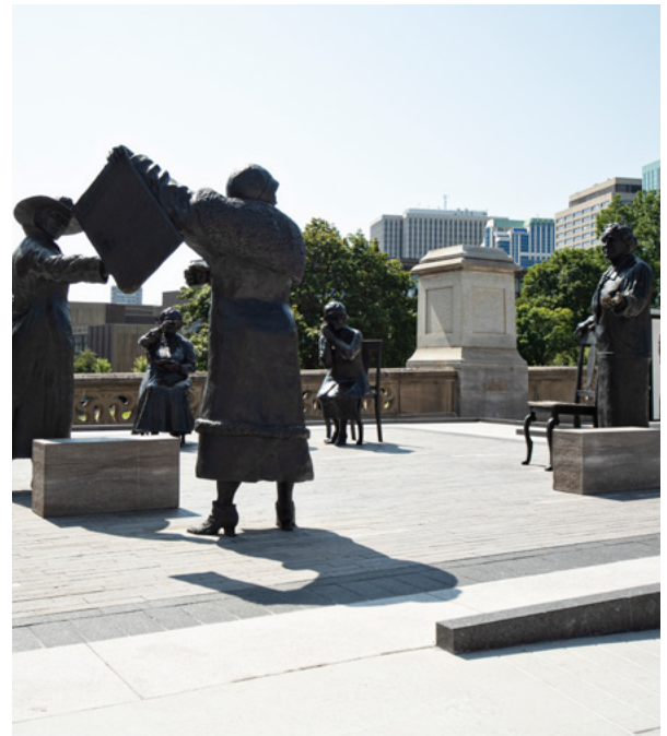
The “ Women are Persons! ” monument

Now, women play key roles in guiding the deliberations of the Senate. The Red Chamber remains a forum for senators to fulfil the vow Muriel McQueen Fergusson made when she first took her place in the Chamber: “If I can be of help to women in getting justice, I will.”